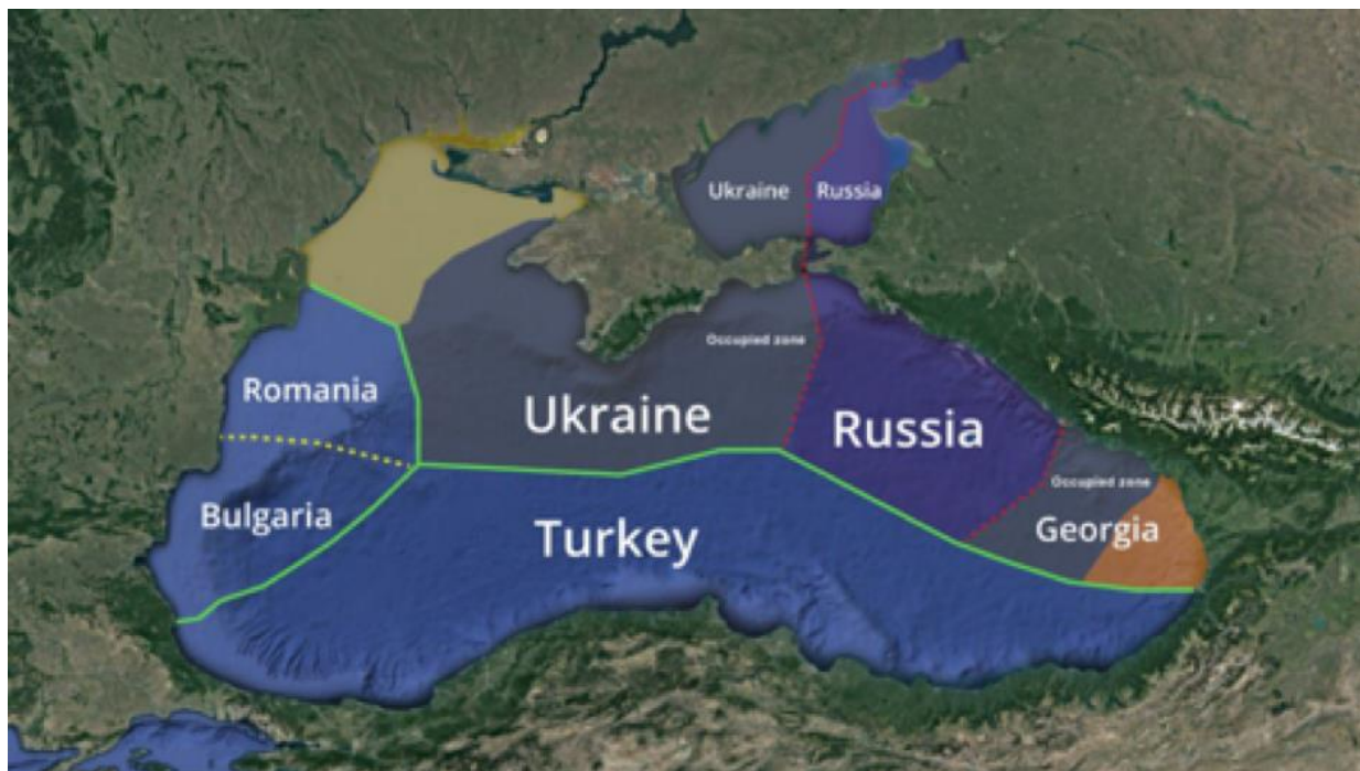
Schematic Map 1

the Azov Sea—about 2/3 of its total area as well as the strategically important Kerch–Yenikale canal, the trade route between the Black Sea and the Sea of Azov.